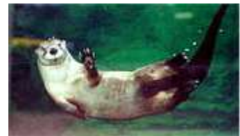
Daily at 12:30